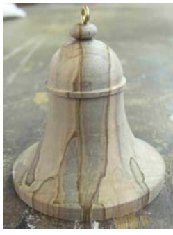
Xmas bell, clapper can move