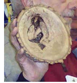
Bernie showed a natural edge bowl of unknown spalted wood with bark inclusions. Suggestions were to not fill the voids with "coffee grounds" or "inlaid" – rather "just put a finish on it and be done".

Members suggested leaving the bottom round, three cornered (feet), or making a 'standard' foot