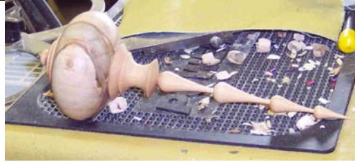
Pictured is a finished Christmas ornament in ambrosia Maple and Walnut instead of a Sea Urchin shell center