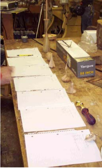
silent auction items turned by Bob Rosand on display