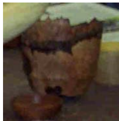
Bill George - a small Cherry bowl made from "Dooleywood" with a natural edge