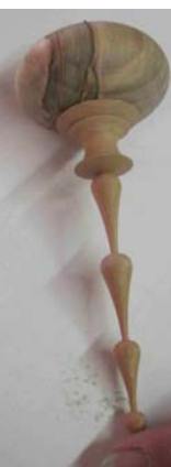
Signed Xmas ornament