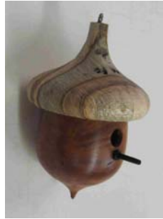
Acorn bird house