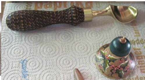
Ice cream scoop & bell