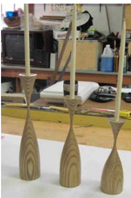
Set of candlesticks