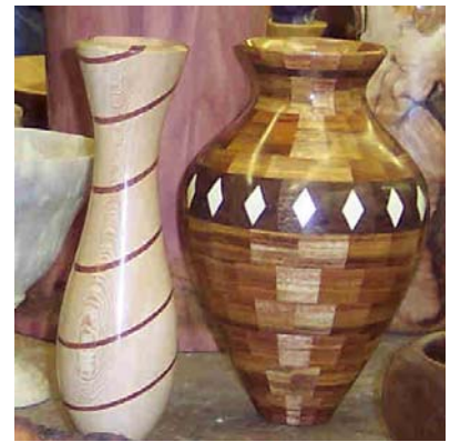
Ian Manley with a finial box of Ash finished with nothing more than the Beal Buffing System. He also showed a vase of Canary wood, Walnut and Holly, and a weed pot of Maple and Mahogany that utilized a cigar tin holder (from Peter) to hold water--