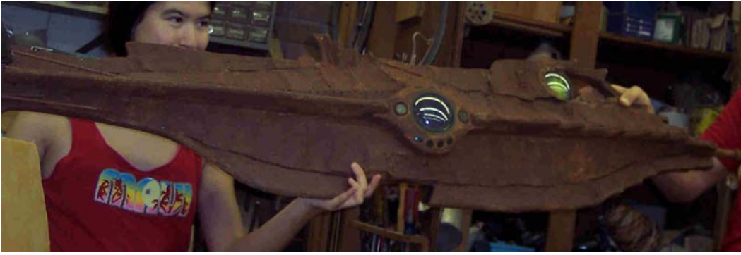
Model of Nautilus submarine fabricated for Boy Scout camp from Styrofoam covered with iron filing and rusted in seawater