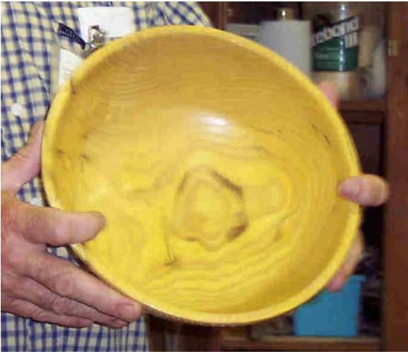
Bill Dooley with a large mulberry bowl. He also had a White Oak natural edge bowl with a feather / crotch pattern in the center.