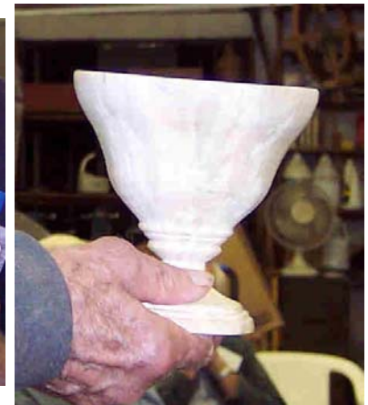
Wally Kemp with a piece of spalted bleached Holly finished with wipe on poly. Wally also had an Eastern White Pine bowl with a circle of knots around the outside edge that looks like Norfolk Island Pine