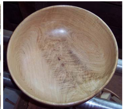
Show and Tell items