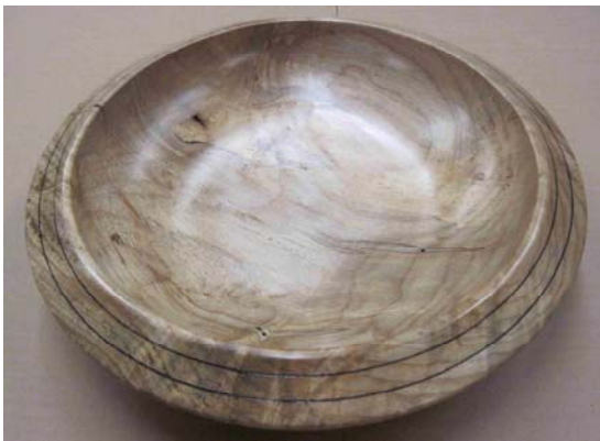
Ron Robertson displays a Maple bowl inspired by Jimmy Clewes. It has a brass inlay groove formed first into a v shape. Then brass powder and resin was mixed together and smeared over the top. Ron cut it back to expose the outline of the groove and sanded it the rest of the way.