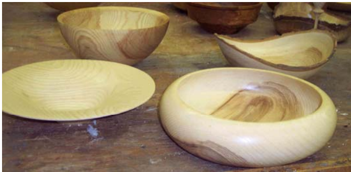
Four bowls from Bob Trucchi in a lacquer finish of maple, ash o different shapes and designs