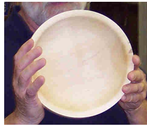
Paul O'Neil shows a shallow maple bowl. He also had one in walnut.