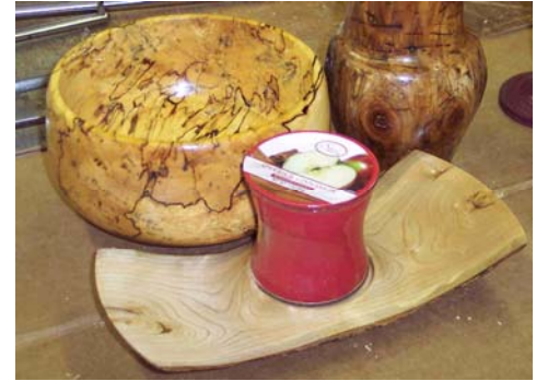
Spalted Chestnut bowl and a Catalpa candle in board by Ben Natale