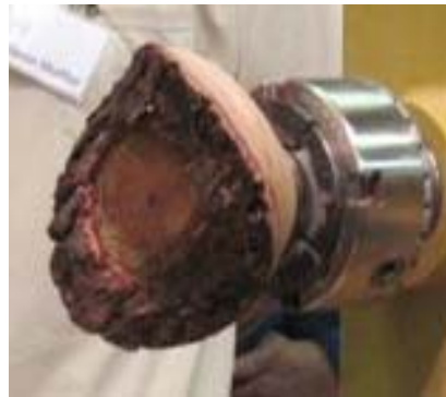
Ready for hollowing