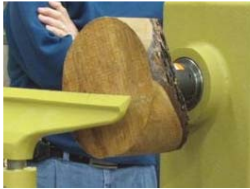
Bowl blank mounted for turning