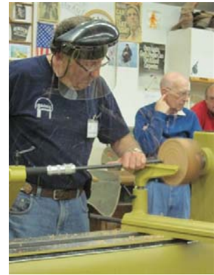
Shaping the bottom