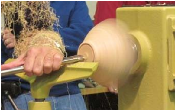
Preparing the tenon before remounting