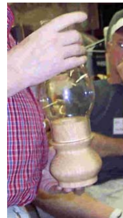
Don Dietrich holds one of two candle lanterns he turned from Sugar maple.