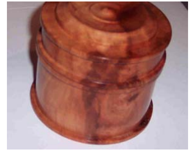
9 Jeff Keller's "Chestnut" box