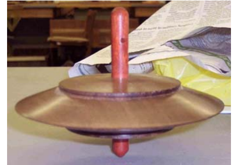
- Jeff Keller's "Walnut spinning top w/Bloodwood stem