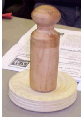
-Emilio's kit for making seed starter containers