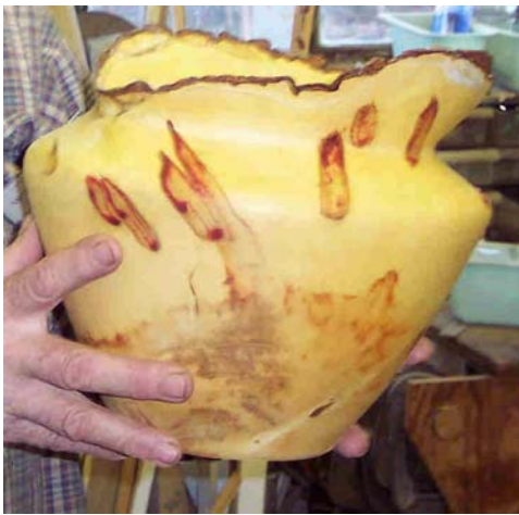
10-Bill Dooley s Box Elder natural edge bowl