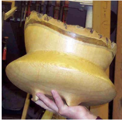
11- Ken Lindgren's Amur Cork tree bowl w/carved feet