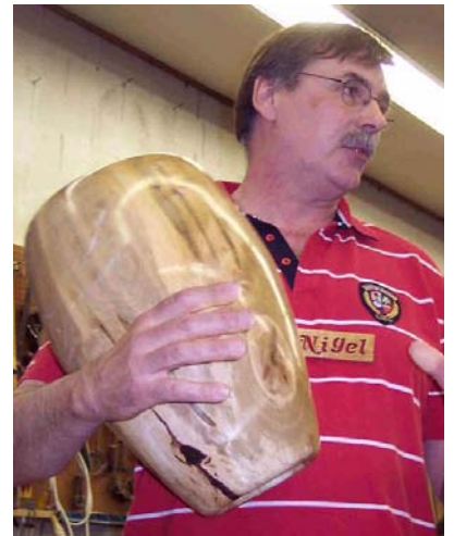
6 - Nigel Howe - Ambrosia Maple vase