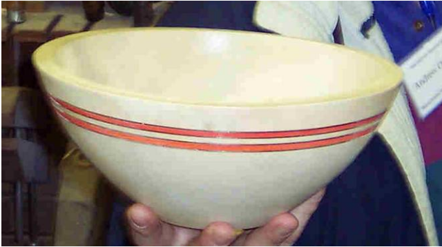
1-Andy Osborne holly bowl w/burnt lines, orange dye stripes